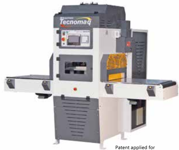
Patent applied for