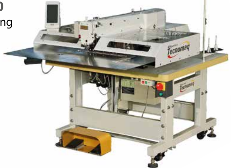
MTS-4530 Automatic Pattern Sewing Machine