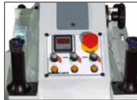
Three cut pressures