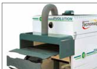
Optional-reuse of hot air