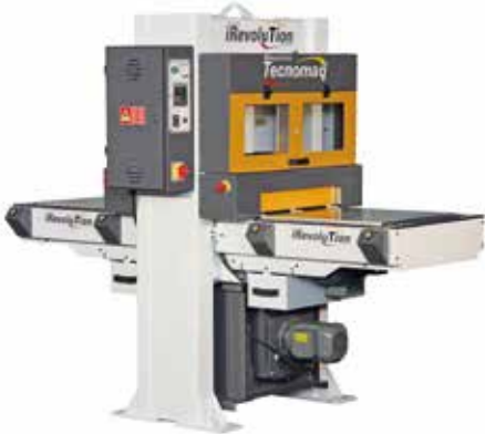
MT 29 IR