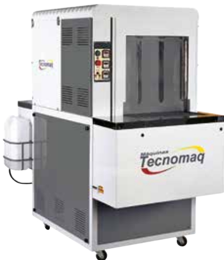
MT-105 3 WAYS