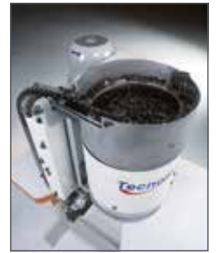
MT 126 AL/VIBRA