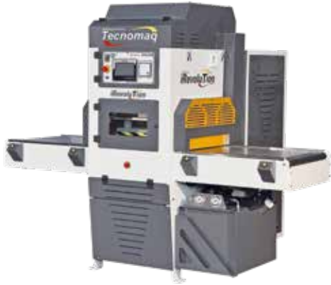
MT 15 KW HC IR