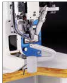
MT 126/1 Big. Móvel