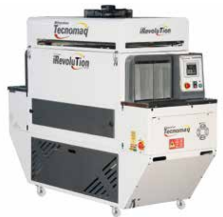
MT 135 IR