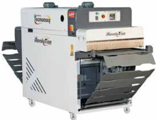
MT 2017 IR