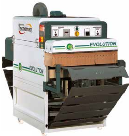
Patent applied for