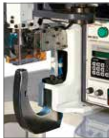
MT 126/1 Big. Fixa