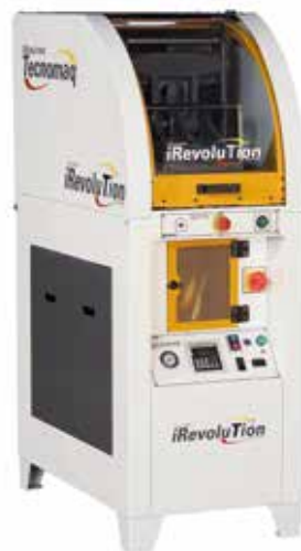
MT 123/1 IR