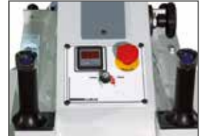
One cut pressures