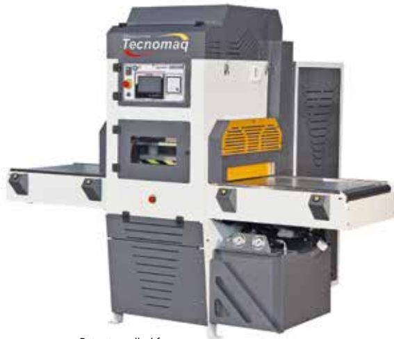
Patent applied for