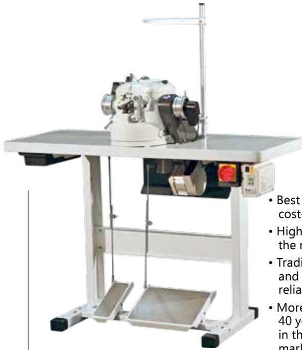
MT-140 Sewing Machine