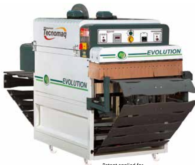
Patent applied for