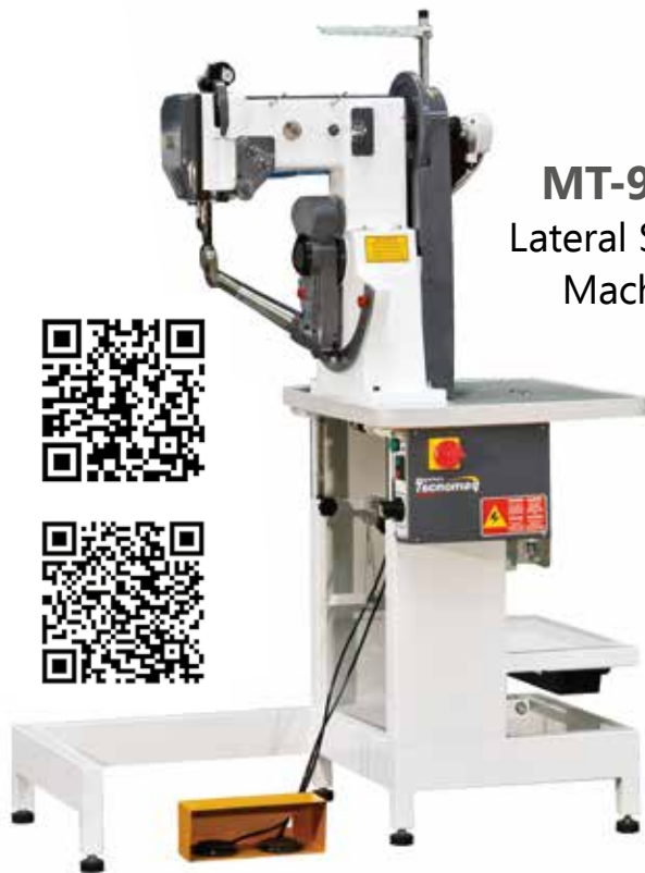
MT-9000 Lateral Sewing Machine