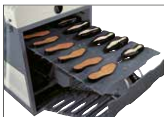
Sole and Upper position