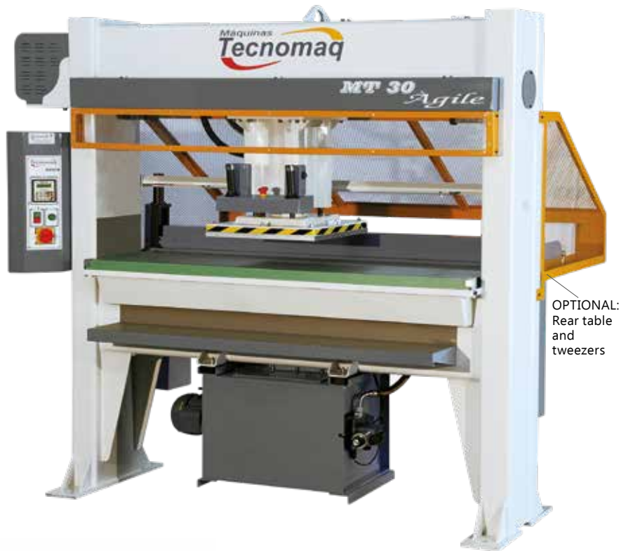
OPTIONAL: Rear table and tweezers