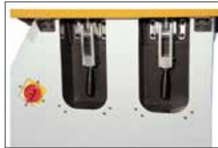
Fast membrane change system Patent applied for